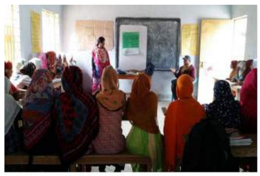
Life skills training at high school level

366 girls were participated from 25 schools in shimulbari, Dormopal. Khutamara. Kaimari, Golna & mirgani union. The main content were current situation for girls & what were the main problem for child protection & they What is like, what is skill, stages of life skill, how to use life skill, elements of life skill topics were discussed in the training. Group work and presentation also exercised in the training. The trainings were facilitated by CAR- Trainers, TO & PC of USS, Jaldhaka branch.