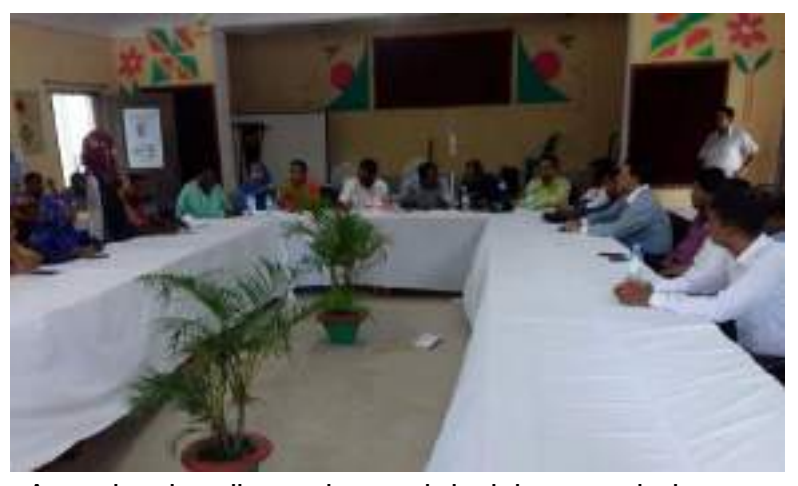
Agenda wise discussion and decisions are below:

Follow up the previous meeting decision as per regulation: After review the last meeting minutes, member of Youth network presented the CP situation in their Area. Such as Child marriage, rape, dengue, Sanitary napkin preservation etc. They also shared that youth network continue dengue prevention campaign in their Union. In campaign they included