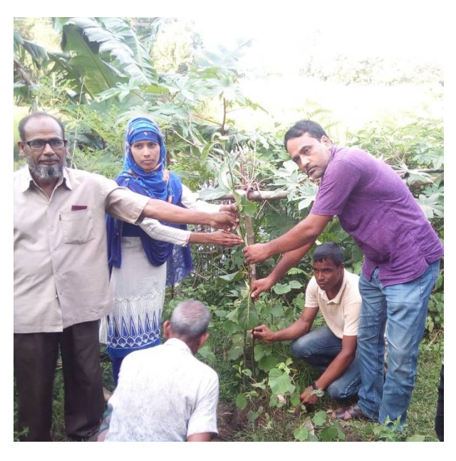
CBCPC & Union parished member helps on Tree Plantation campaign