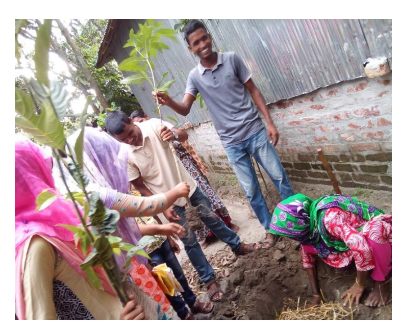
Kaimary youth forum organized Tree Plantation campaign

forum collect found & provide 250 sapling to SC families. They also provide practical support to plantation. Koimari UP Chairman, Member, CBCPC members also help them in campaign.