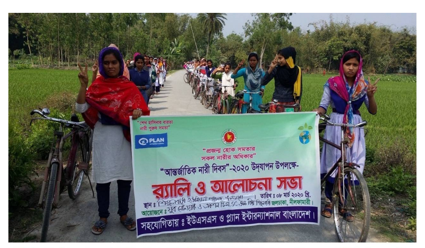
Members of Union Youth Network and School Girls Action Team rally with others girls on International Women's Day at Shimulbari Union, Jaldhaka Upazila.

CBCPC & youth network jointly observed national victory day, International mother language