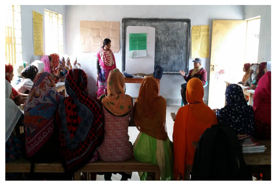
Life skills training at high school level

366 girls were participated from 25 schools in shimulbari, Dormopal. Khutamara. Kaimari, Golna & mirgani union. The main content were current situation for girls & what were the main problem for child protection & they What is like, what is skill, stages of life skill, how to use life skill, elements of life skill topics were discussed in the training. Group work and presentation also exercised in the training. The trainings were facilitated by CAR- Trainers, TO & PC of USS, Jaldhaka branch.