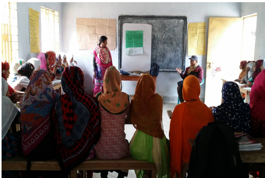
Life skills training at high school level

366 girls were participated from 25 schools in shimulbari, Dormopal, Khutamara, Kaimari, Golna & mirganj union. The main content were current situation for girls & what were the main problem for child protection & they What is like, what is skill, stages of life skill, how to use life skill, elements of life skill topics were discussed in the training. Group work and presentation also exercised in the training. The trainings were facilitated by CAR- Trainers, TO & PC of USS, Jaldhaka branch.