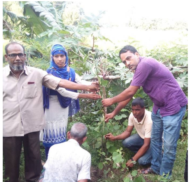
CBCPC & Union parished member helps on Tree Plantation campaign