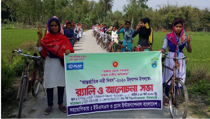
Members of Union Youth Network and School Girls Action Team rally with others girls on International Women's Day at Shimulbari Union, Jaldhaka Upazila.

CBCPC & youth network jointly observed national victory day, International mother language day, Independent day & International women's day in six unions & upazila level. which was observed with collaboration with government, UPs, Schools and community by the support of USS and Plan International Bangladesh in reporting period. Human chain, Rally drawing competition, poem recite, debate competition also arrange for children and youth forum members as well school students by the cordial support of UP and school teachers. Discussion session and prize distribution ceremony also took place as