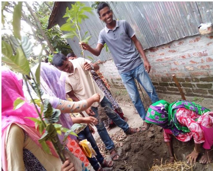
Kaimary youth forum organized Tree Plantation campaign