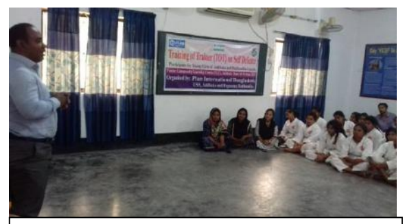
Speech of UNO Jaldhaka

this training they will protect themselves. Thanks USS, Rupantor plan International Bangladesh for arrange this training. I will support others Union in Jaldhaka Upazila to arrange self defence training & share UNO of Hatibandha & DC Nilphamari.