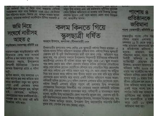
Journalist stood against rapist

checkup and treatment. Two Network members provided mental supports to PINKY.